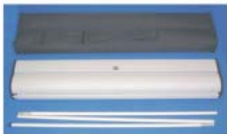
Kit includes : base with cartridge, bungee pole set and carry bag