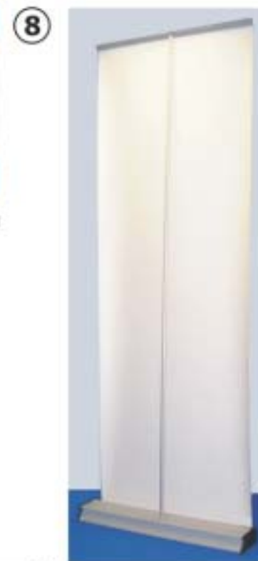
8 Finally secure the banner into position by locating the top rail hole with the bungee pole