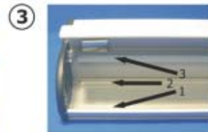
3 Lift open the lid and note the 3 grooves inside the base