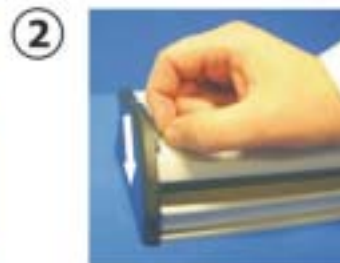
2 To open, slide down both locking tabs on the left and right sides of the base