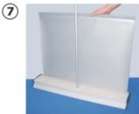
7 Lean the bannerstand backwards and extend the banner by lifting the top rail until the complete image is visible