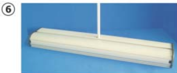
6 Assemble the bungee pole and insert into the base