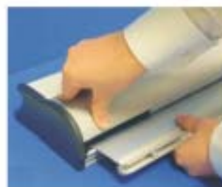
To lock slide up both locking tabs into the position shown