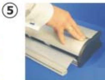
5 To close press down firmly onto both the left and right sides of the lid until an audible click is heard