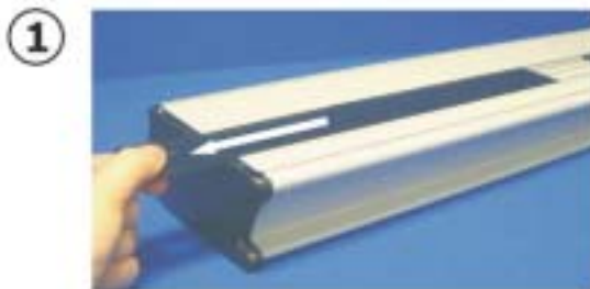
1 From the rear of the base, slide open both pole retainers and remove the bungee pole set